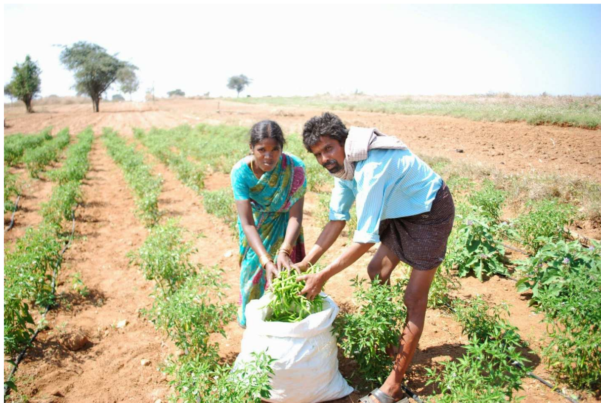
Fig 3: Drip irrigation in Israipally village, Thalakondapally Block in Telangana

different crops (Indian National Committee on Irrigation and Drainage, 1994; Indian National Committee on Irrigation and Drainage, 1998).