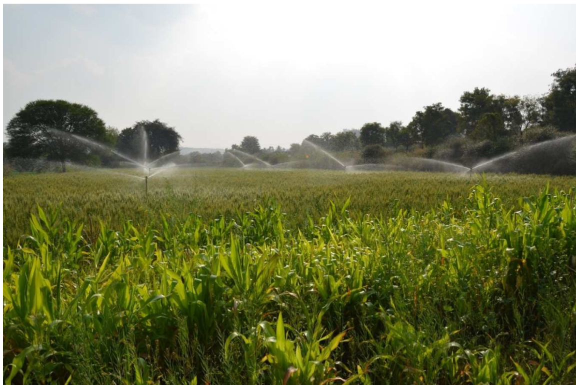
Fig 5: Sprinkler irrigation in Narayanganj block, Mandla district, Madhya Pradesh

Below are some highlights of the work done at the three locations and some of the results: