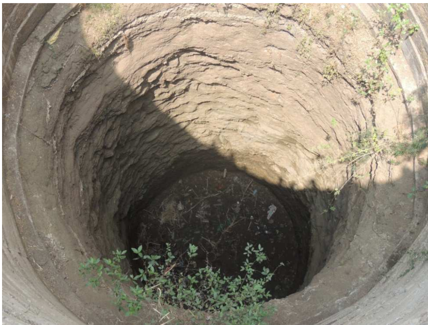
Fig 1: Empty wells, a common sight as groundwater levels plunge across the country

A scarce natural resource, water is fundamental to life, livelihood, food security and sustainable development. India is one of the most water-challenged countries in the world, with 16 per cent of the world's population and access to only 4 per cent of the world's water resources. About 90 per cent of the fresh water withdrawals go to agriculture in India, which is well above the global average of about 70 percent (Food and Agriculture Organization, 2016). A growing population and farmers' traditional use of inefficient flood irrigation have meant that groundwater levels have fallen over the years. Shortages with water for domestic use, including drinking water problems are rampant across the country. Of all the economic sectors, agriculture is the one where water scarcity has greater relevance. India is fast moving towards a crisis of ground water overuse and contamination (Kulkarni, et al., 2015). Heightened weather variability, increasing frequency of extreme weather events and other indicators of climate change only exacerbate this crisis. Longer dry spells and heavier precipitation events projected for South Asia are going to increase run off and hamper ground water recharge (Singh, et al., 2014)