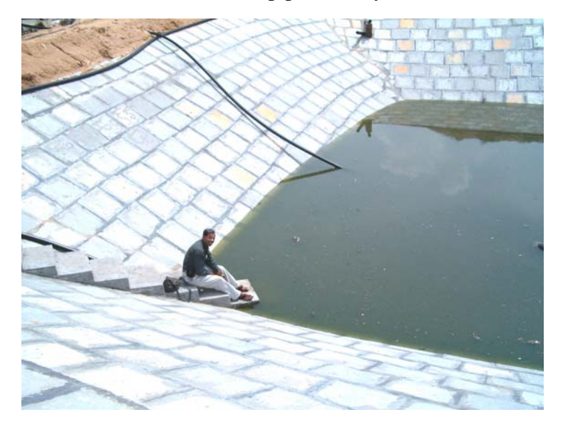
Figure 2 shows the Deep pond<sup>TM</sup> (Pond #1).

Figure 1. Schematic of the deep pond<sup>TM</sup> system