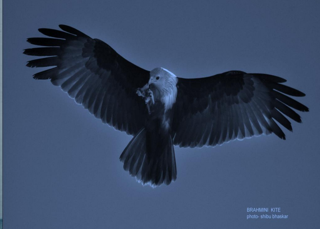
BRAHMINI KITE