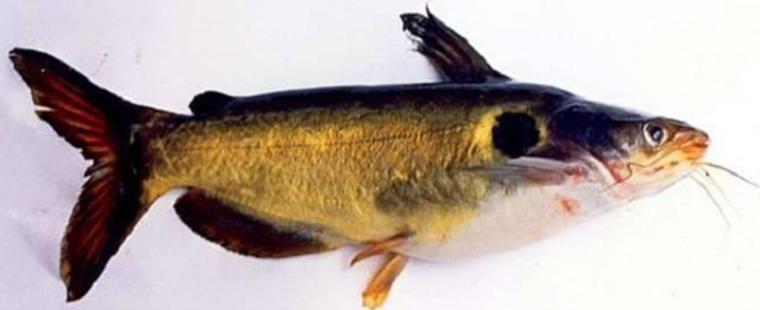
the esteemed golden catfish of Kuttanad