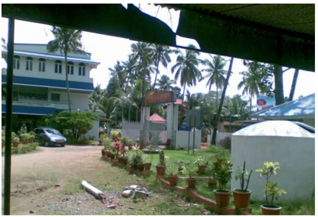
Rainwater falling on the multi-storied building at KIDS campus is collected and diverted to the well, which is given a tank like coverage structure above ground. The quality of water in this well and surrounding areas drastically improved as a result of this measure. KIDS attempted injection of rain water from a 600 square feet auditorium in to a large contaminated well in their own campus in 2005, taking advice from Mr. Terry Thomas of PLANET Kerala. This turned out as remarkable success. Water quality of this contaminated well and other wells in its vicinity improved. This is a clear example of how injecting rainwater in to one large well could influence the near by areas. The process of quality improvement of water is more effective if the soil is mostly sandy in nature. Back washing is most effective, in the sandy soil as the water could move through the interstitial space of the sandy soil, thus flushing out the excess nutrients and contaminants found in its midst.

Programme facilitated by PLANET Kerala and KIDS in the wake of the Tsunami; 2) CBDP- Watsan programme component supported by Caritas India and facilitated by KIDS and PLANET Kerala; and 3) Mazhapolima intervention by Thrissur District Administration. 14 water sources were recharged under Green coast- IUCN programme, 23 wells under the CBDP and 102 wells under Mazhapolima Mazhapolima programme in this riverine island. The intervention is emerging as a model in mitigating drinking water scarcity in coastal- lowland- water logged region in Kerala. The cost of the intervention is rather on the lower side and the effects are far more. Being a high water table area with serious water quality issues and salinity intrusion, the only way out was to adopt methods to improve surface water sources. That is what was done through injection of fresh water to the ponds and wells in VP Thuruthu. They connected gutters to the roofs and directed rain water to ponds and wells. It was an effort to create a fresh water buffer around the wells. Excess contamination would be typically around the wells. Injection of fresh water helped flush and dilute these and create fresh water zones around wells.