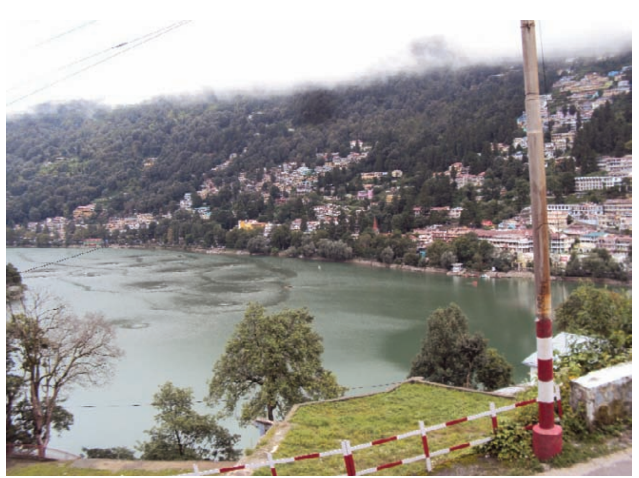
Photograph 8: Conserved Naini lake, Nainital, Uttarakhand Source: Water Unit, CSE

Graph 1: Decline in the trends of BOD and increasing trend of DO in the Naini lake post revival programme 25 DO – top DO - bottom 20 BOD 15 mg/l 10 5 0 2006-07 2011-12 2003-04 004-052005-06 2007-08 2008-09 2009-10 2010-1 Source: Rawat, A.S. and Raju, S. 2010. Nainital Beckons. 60 p.