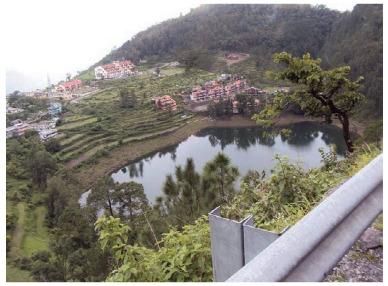
Photograph 6: Upcoming housing project near Khurpatal, Uttarakhand.

the Army Welfare Housing Organization (AWHO). The builders have bored in the adjacent areas of the lake in 2002 and since then the lake water started to decline. Residents of at least seven villages downhill of the lake are facing water shortage because of the project. They observed the reduction in the flow of water in their springs first in the summer of 2003, a year after AWHO began construction work on its colony of 80-housing units. The spring flow in these villages become negligible during the lean period and most people in the area have already abandoned farming and started migrating for contract labour<sup>8</sup>. Dr. Ajay S. Rawat, Professor of History in Kumaon University was successful in bringing the case to the notice of Uttarakhand High Court in 2009.