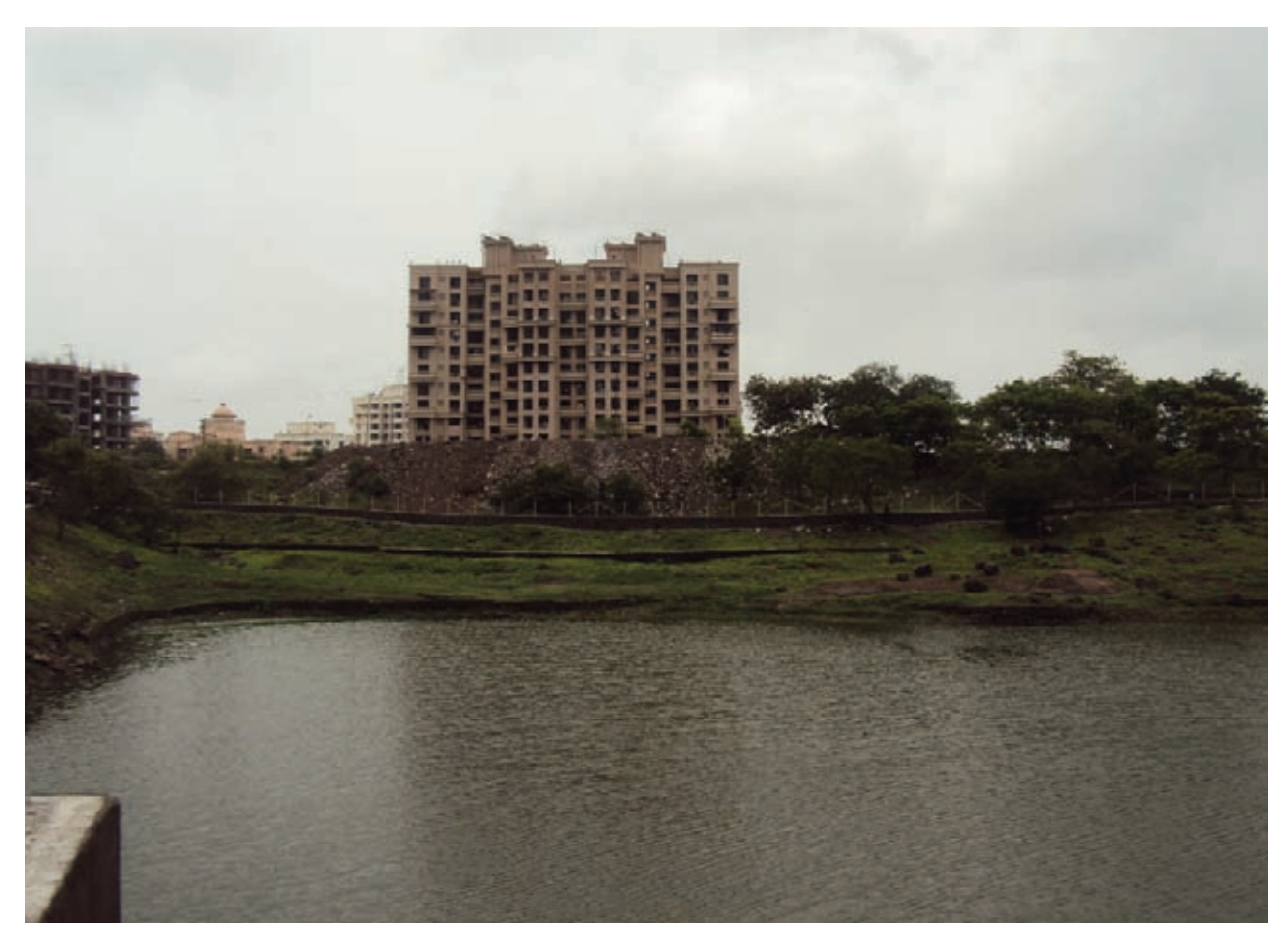
Photograph 10: Restored Upvan lake