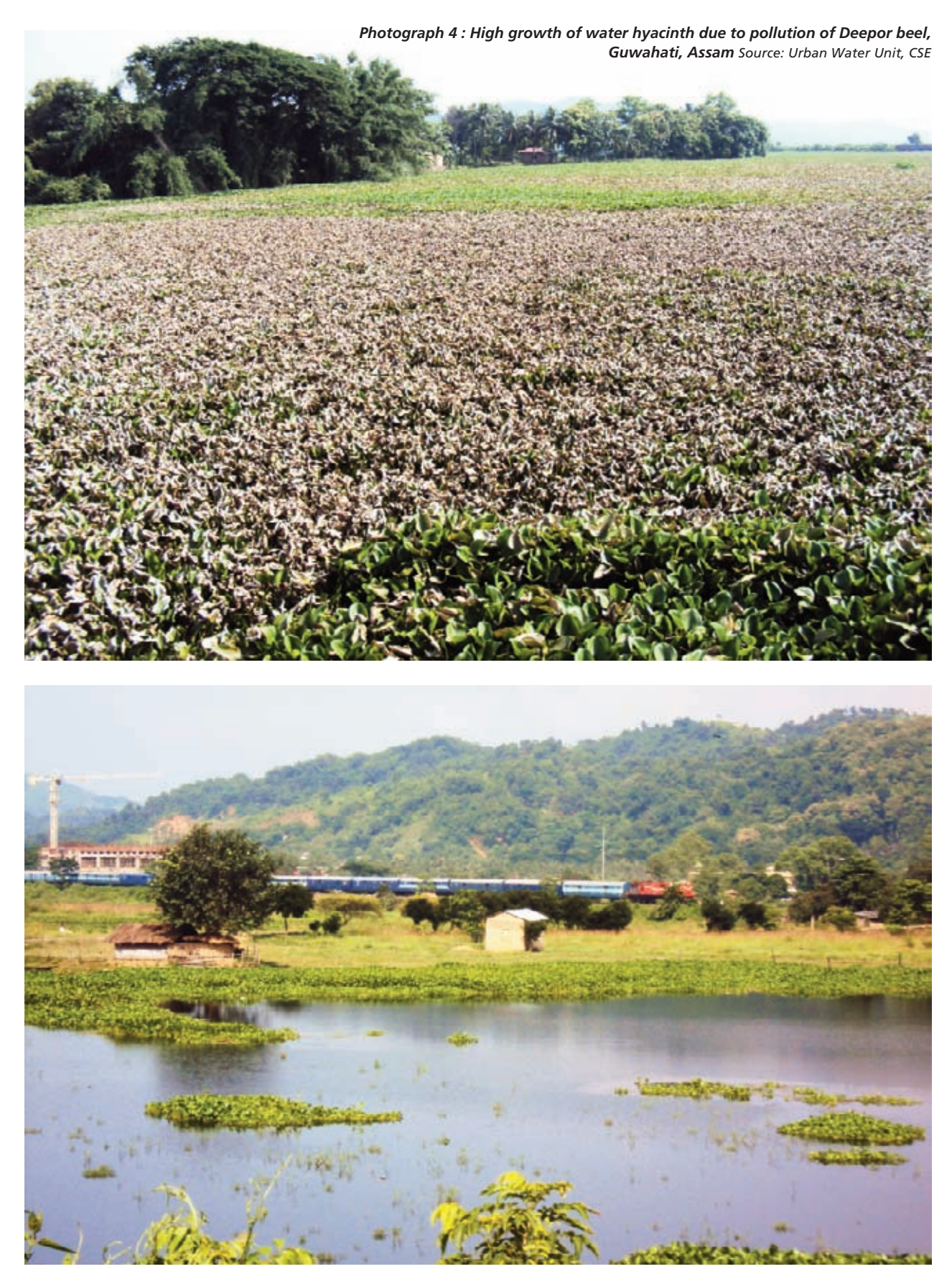
Photograph 5 : Encroachment of the Deepor beel by railway tract, Guwahati, Assam