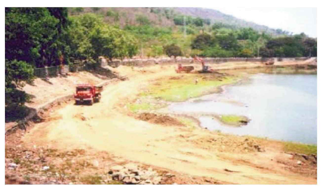
Photograph 9: Upvan lake before the restoration process