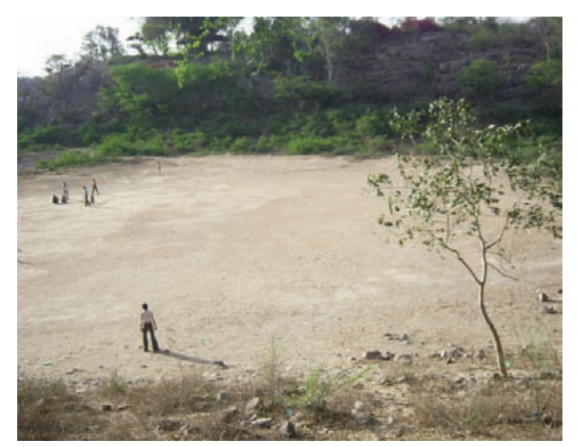
Photograph 2: Dry Badkhal lake bed

Pollution Control Board (CPCB) and Haryana Pollution Control Board. However, mining is such as flourishing and lucrative economic activity that the activity continues unabated and government has failed to take appropriate steps to ban/regulate mining. Right now both Surajkund and Badkhal lakes are in a degraded dry condition.