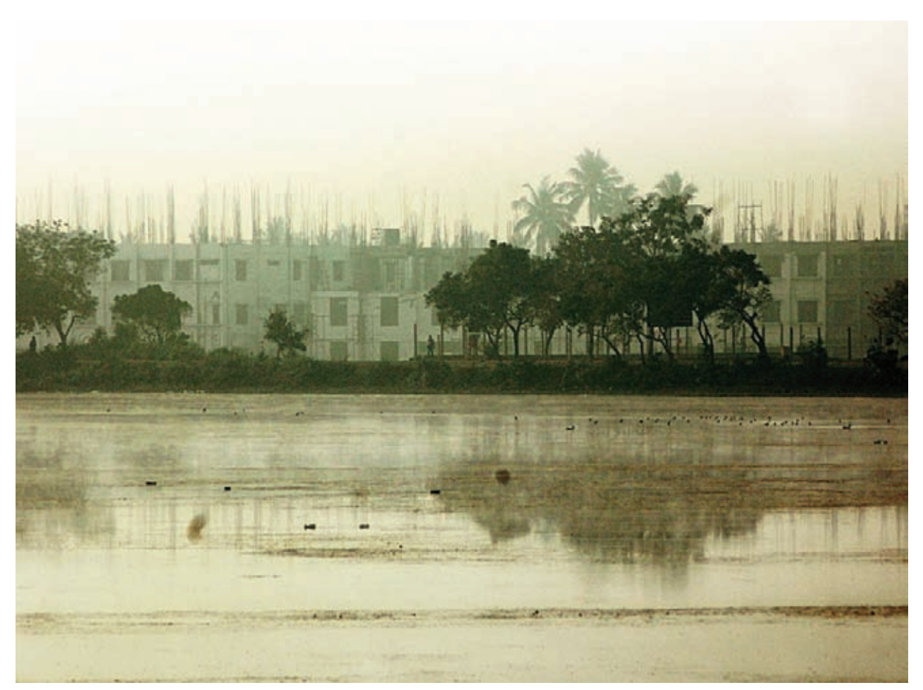
Photograph 7: Construction near the Ousteri lake, Puducherry, February 2006

21 NGOs in Puducherry formed the Ousteri Protection Coordination Committee (OPCC) in order to save the waterbody. In 2006, OPCC protested against the Environment Impact Assessment report submitted for the project clearance. OPCC also filed a PIL in the High Court of Tamil Nadu against the Union of India, PWD, Pondicherry Pollution Control Committee and the Trust, regarding the illegal construction of Medical College and Hospital adjacent to the Ousteri Lake. The case is pending in the court for more than five years. The college has already started functioning. In spite of all the efforts by the civil societies, the movement is facing an uphill battle because of absence of any administrative framework to protect the waterbody.