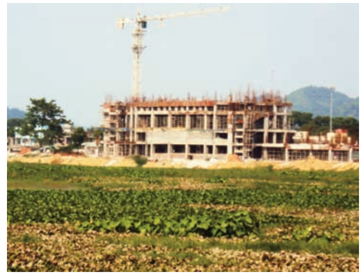
Photograph 3 : A building constructed in the middle of Deepor beel, Guwahati, Assam

Besides functioning as a major rainwater storage basin for Guwahati, Deepor beel has an immense biological and ecological significance. It was designated as a Wildlife Sanctuary in a preliminary notification in 1989 and was declared a Ramsar site in 2002. The beel is also an important staging site for migratory waterfowl. The waterbody is a home to a large number of vegetation and animals, including some endangered species such as spotbilled pelican and greater adjutant stork. However, the high biodiversity of the wetland ecosystem is being threatened due to degradation in water quality, illegal poaching and considerable human-induced disturbances.