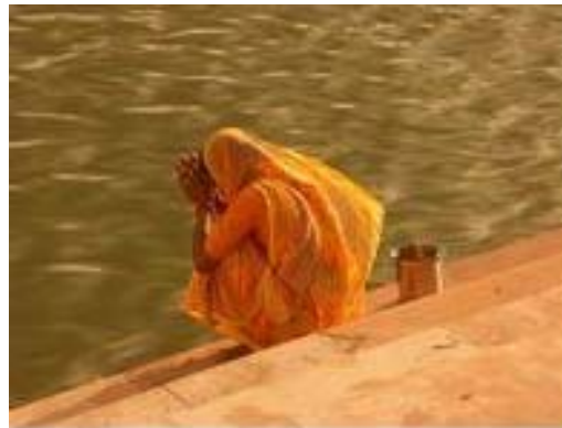
Woman praying at Pushkar Lake, India

It is very significant to note that hardly about 10% of the total Water Resource available is under consideration for diversion in the entire 30 –Link proposed National River Linkages Project.