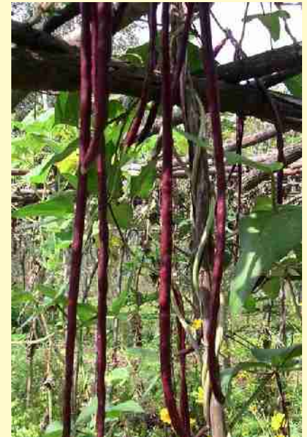
RED LONG BEAN