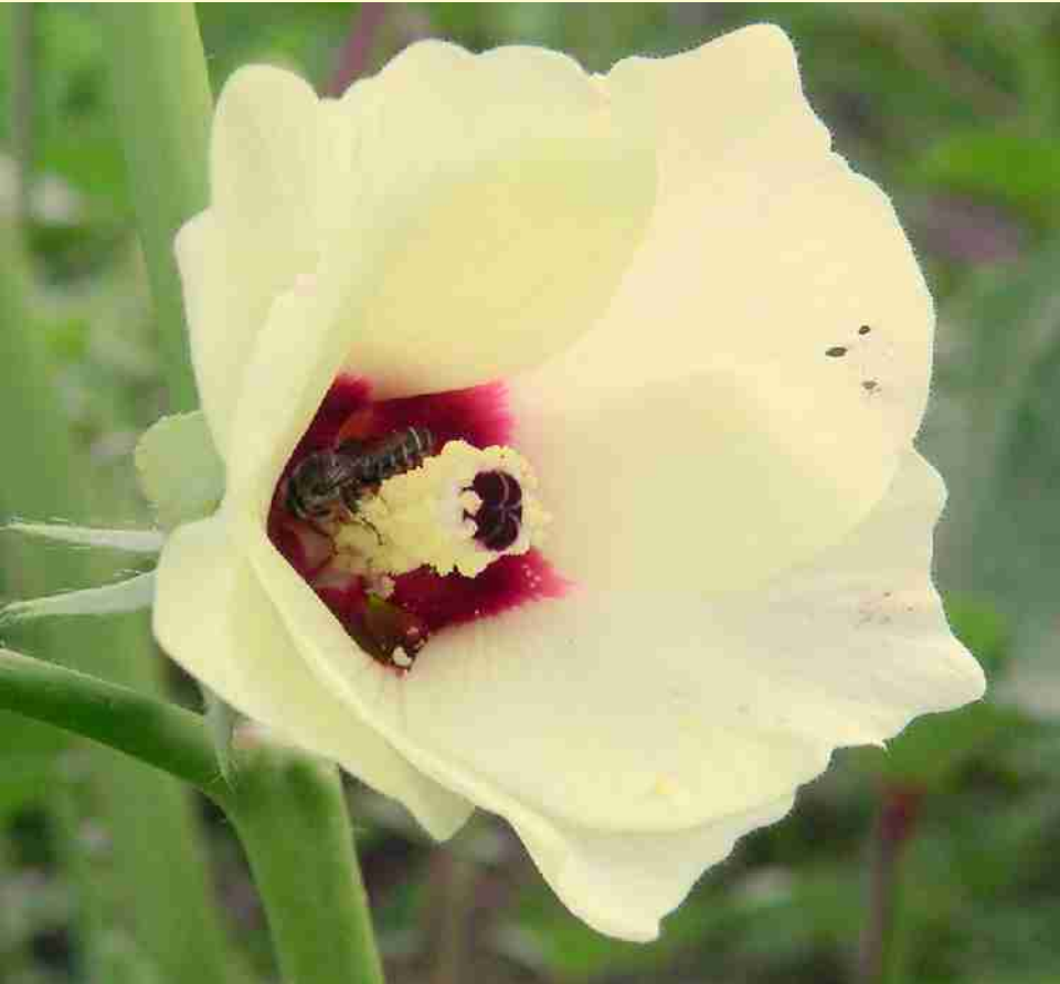
Green lady's finger