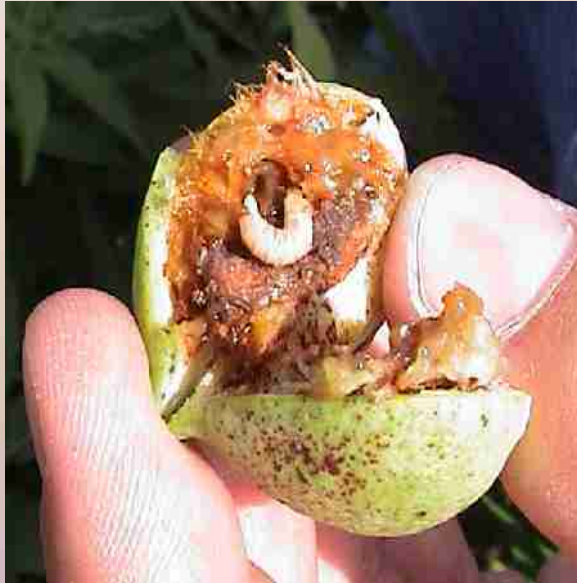
Boll Worm in Early Stage