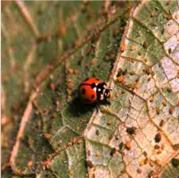
Lady bird Beetle