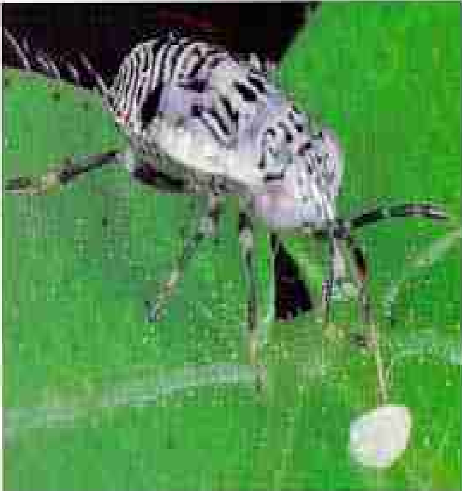
Big-eyed bug nymph feeding on bollworm egg