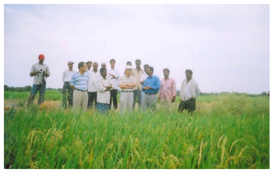
water in Andhra Pradesh.

Any transfer of technology in Indian rural scenario needs consistent training programme and follow up for a minimum of three years. This point also emerged clearly during the discussion with the agricultural scientists and extension service experts. Large canal irrigation schemes being potential for paddy, the attention towards propagating SRI should be intensified. It was estimated that SRI method alone could save about 264 TMC of