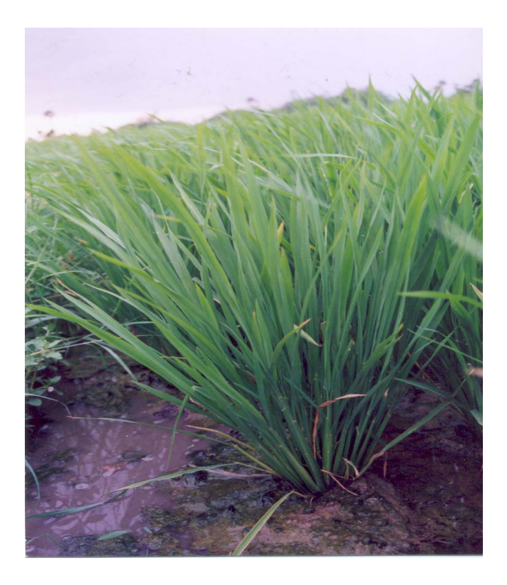
programme supported by Irrigation and CAD, GOAP and WALAMTARI