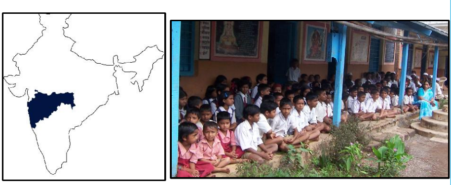
Chikali lies on the western side of Maharashtra

We organized a handwashing program in a government school in Chikali, a village of 5000 people. Our target was the 100 school children ranging from Standards 1 to 7. Also there were the teachers, school administrators at the district level, the Sarpanch and other members of the local Gram Panchayat.