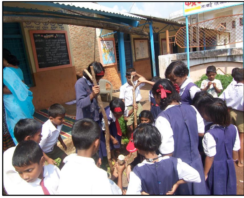
Team Ganesh building their tippy tap during the competition

We had tippy tap building а competition. Each group had to build a tippy tap using tippy tap "kits" that we had assembled and brought to the event. Each tippy tap had sticks, rope, soap and a container. The holes for the supports were dug prior to the event in order to save time and assist the younger children. The children put the tippy taps together very quickly, with minimal instruction. All were well built, which made judging difficult. One team had planted some small saplings near the tippy tap in order to capture the used water. They were judged the winner.