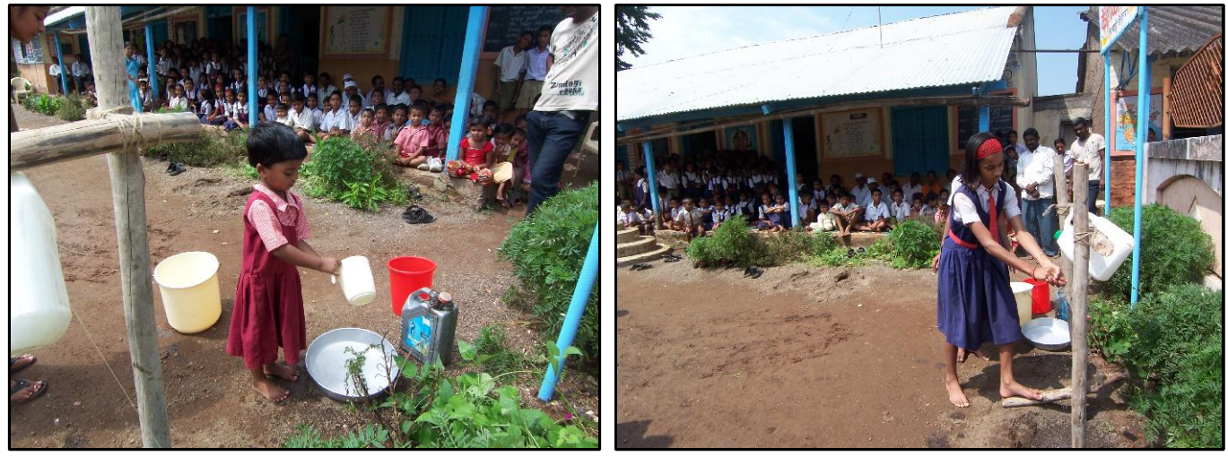
A student demonstrating the amount of water required to wash your hands in the traditional manner using a mug and bucket.