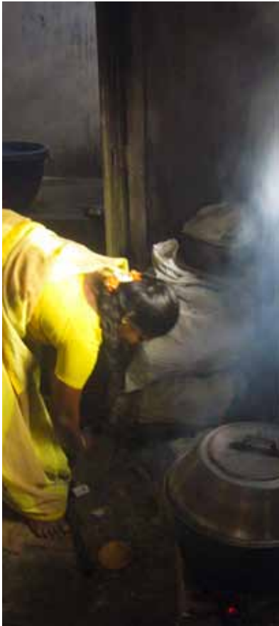
Reducing indoor air-pollution with ARTI.