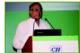
Prof Saugata Roy, Minister of State for Urban Development, Govt. addressing the Green Homes conference on 30th July, 2010 at New Delhi