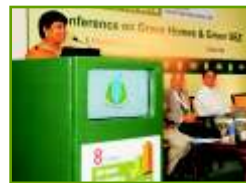
Smt Vasanthi Stanley, Hon'ble Member of Parliament, (Rajya Sabha), Guest of Honour at Green Homes Conference on 9 October 2010 at Chennai