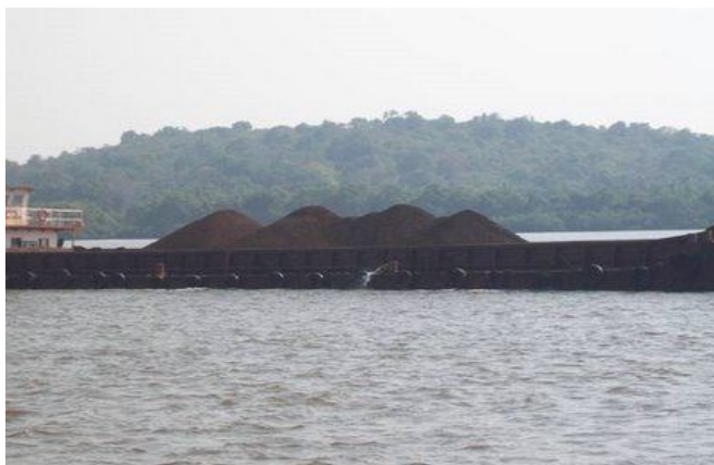
Barge carrying Coal and Iron Ore on the Mandovi.

Mandovi is also known as Mhadei in its upper course in Sattari, one of the talukas from Western Ghat. There are 6 mining leases here within a distance of just 1 km and a Dabose Water Supply Scheme, supplying drinking water to Sattari and nearby region!