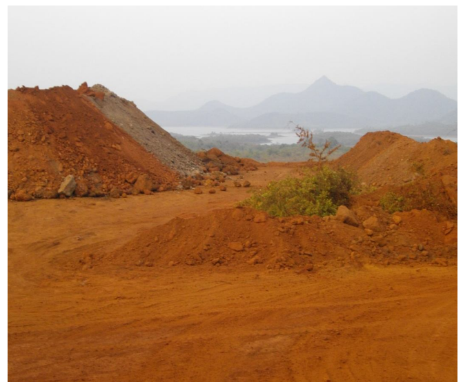
Mounds of mining waste, with Selaulim reservoir in the background.

Goa Water Resource Department The WRD does not have any data on the pollution or siltation of the water bodies in Goa due to mining. When asked under RTI on