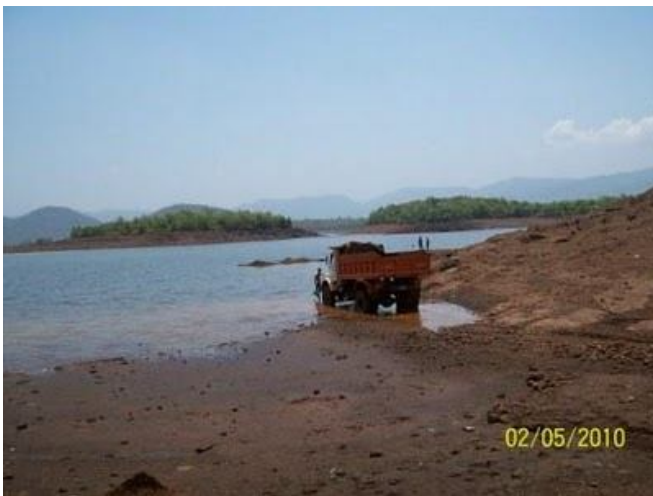
Mining near and inside Selaulim reservoir.

the State Mining Policy to lay guidelines for protecting the water sources, however, the Policy does not even acknowledge the impact of the sector on rivers and water bodies and does not lay any guidelines regarding distance of mines from water bodies, sustainable waste disposal, safe transport of ore from rivers, etc.