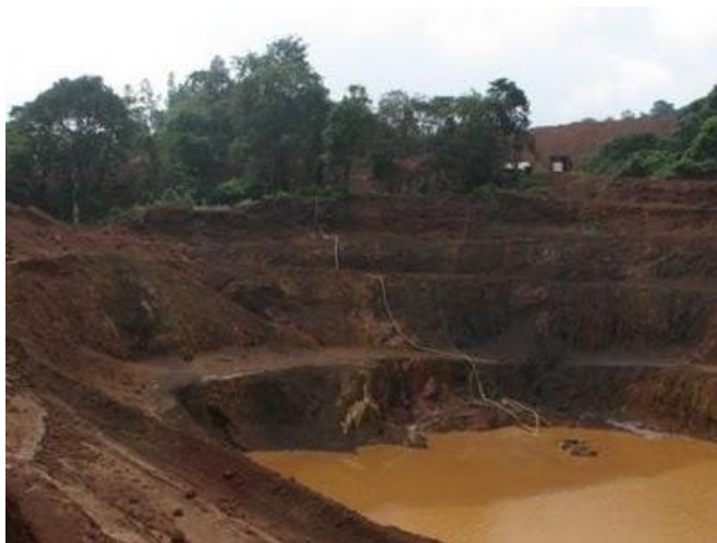
Pumping of water from Cavrem Sheikh Salim mine, severely lowering groundwater table in the village.

Potential threats from Mining Mining has caused severe problems to the ecology and hydrology of the tiny state and most of these have been intentionally downplayed by every office, be it state or the academicians and others. Nearly everyone is involved in mining in some way or other and, no one has tried to assess impacts of mining seriously & comprehensively.