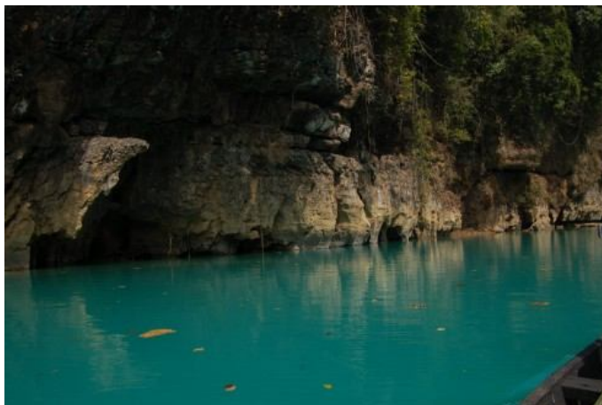
The Blue Lukha River of Jaintia Hills

The Lukha river, which originates from the Nongkhlieh Elaka and flows along the Narpoh reserve forest of Jaintia Hills, Meghalaya, is one of the main rivers that run through the district and drains itself into the Surma valley in Bangladesh. In January 2007, the colour of the river changed noticeably blue, and a big transformation swiftly followed. "The colour started changing first, and then simultaneously all the fish started dying. There was a foul smell lingering in the air for days, and thousands of dead fish were pushed to the banks", describes the headman of Sonapur village, recollecting the event that shocked the locals.