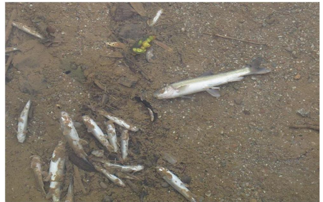
Dead Fish downstream the Gaj II Project

Rivers as irrigation systems, Case of Kholi Khad, Kangra Kholi Khad Mini Hydel Project in Kangra was planned by the State Electricity Board and sanctioned as a run of the river project. However, the water availability calculations of the hydel project proponent were erroneous (as has been the case many times) and in order to generate power, water has to be stored regularly. This has severely affected water releases to 4 irrigation Kuhls, which irrigate about 2500 ha of 12 Panchayats. Now, water is released downstream only when sufficient water for power generation is accumulated in the storage weir.