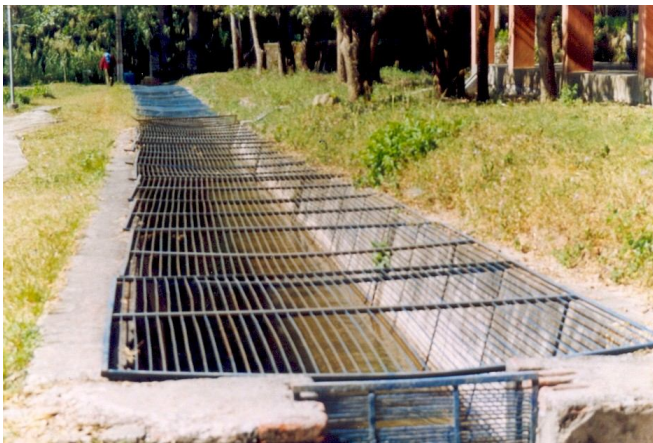
Running Water Fish Culture Units in Himachal

The project does not even follow HP State Notification (2005) that requires developers to release at least 15% of the (minimum annual observed pre project) river flow downstream, as a minimum ecological flow (that itself is a very inadequate quantity to sustain the social and ecological needs of the downstream riverine area). Dead fish on a parched river bed is a common scene here. More than 11000 families in Himachal Pradesh depend on fisheries to make a living.