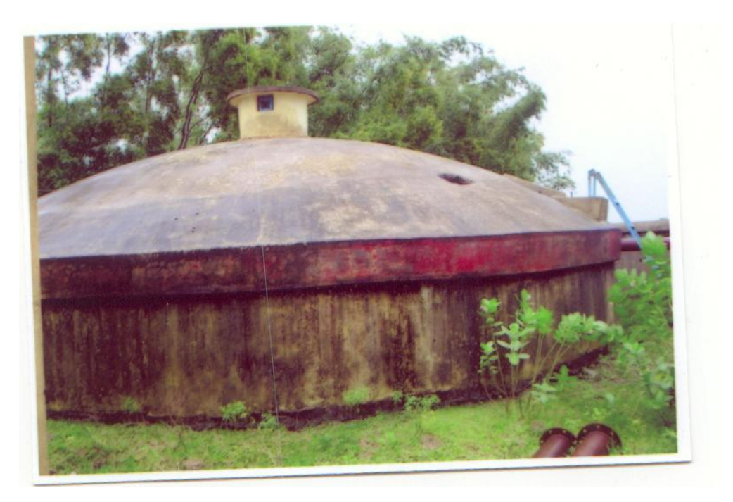
Underground Sump of Bishnupur RPWS constructed prior to 2003, which remained uncommissioned