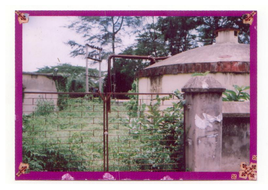
Underground sump for Bishwanathpur PWS in Puri District constructed prior to 2003, reported as commissioned in 2005, remained uncommissioned.