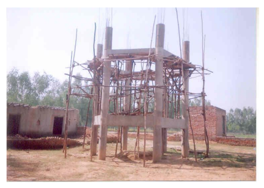
Incomplete OHT at VWSC Sarkara Khas, Moradabad District

of two approved OHTs of total 65 KL capacity, only one OHT of 50 KL capacity was constructed without approval.