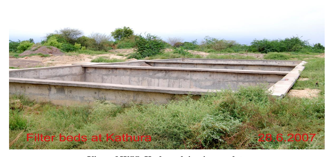
View of WSS, Kathura lying incomplete