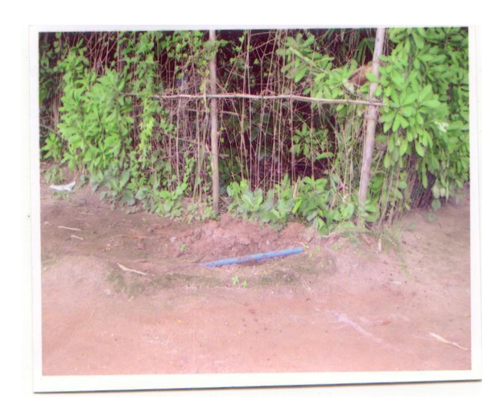
View of Stand Post of Kalyani PWS reported as commissioned as of July 2006

The Government of Orissa stated that the project was now in operation after rewinding of burning motor, transformer and damaged pipe was also repaired. Further, the GP had engaged an operator, the scheme was running and the damaged pipe line had also been repaired.