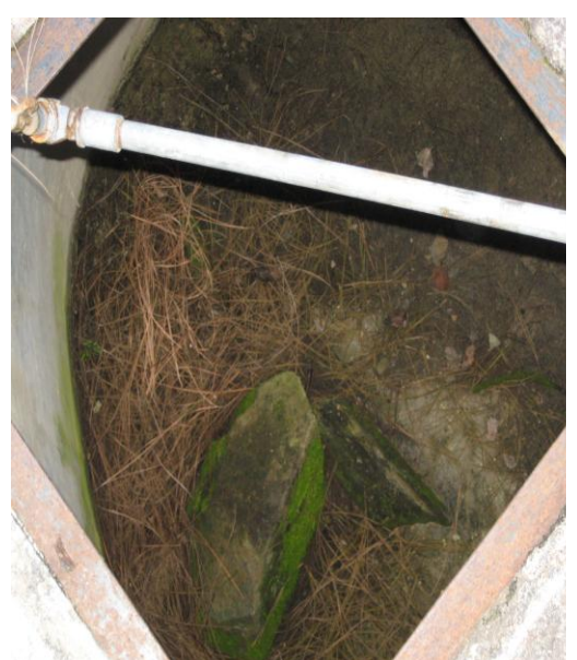
View of Water intake tank and supply tank at Gadpar WSS