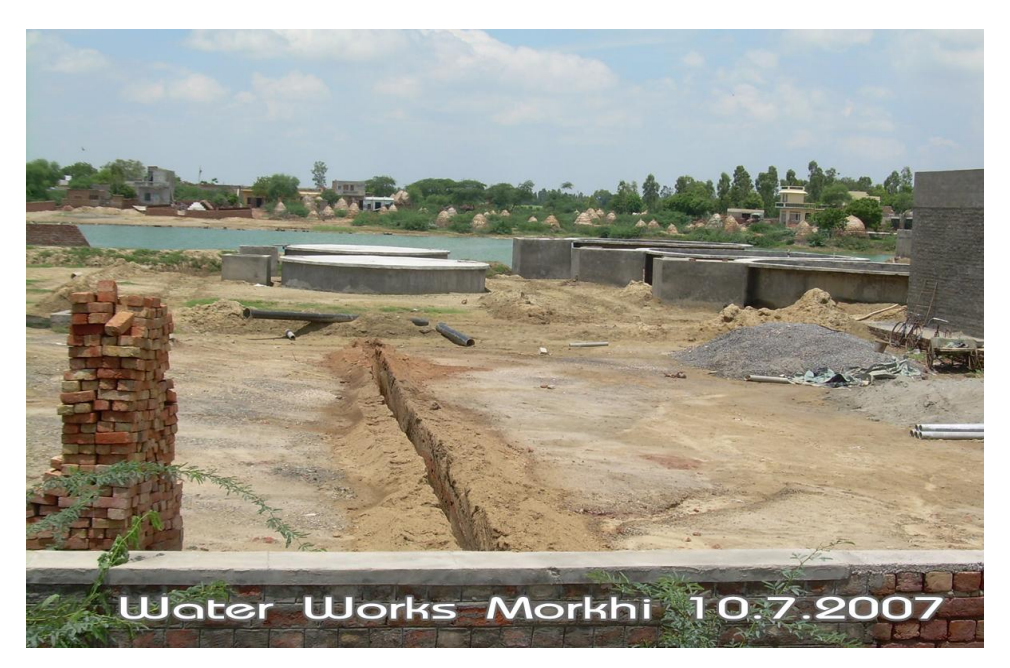
View of WSS, Morkhi lying incomplete

The Government of Haryana generally accepted the facts and stated that suitable action would be taken. It also stated that the schemes at Morkhi, Kathura and Rindhana were likely to be completed by April 2008, June 2008 and August 2008 respectively.