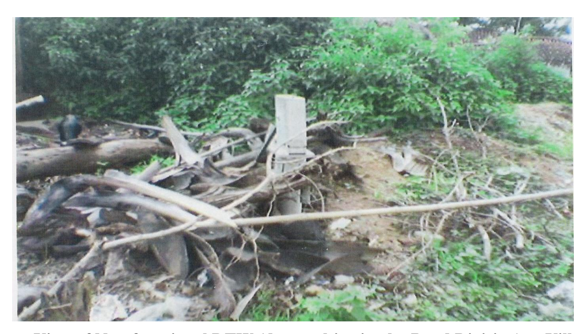
View of Non-functional DTW (due to objection by Road Division) at Village Bargaccha Hariyari, Block Poraiyahat, Godda District

The Government of Jharkhand accepted the facts regarding failure of DTWs and stated that steps had been initiated to reduce such failure.