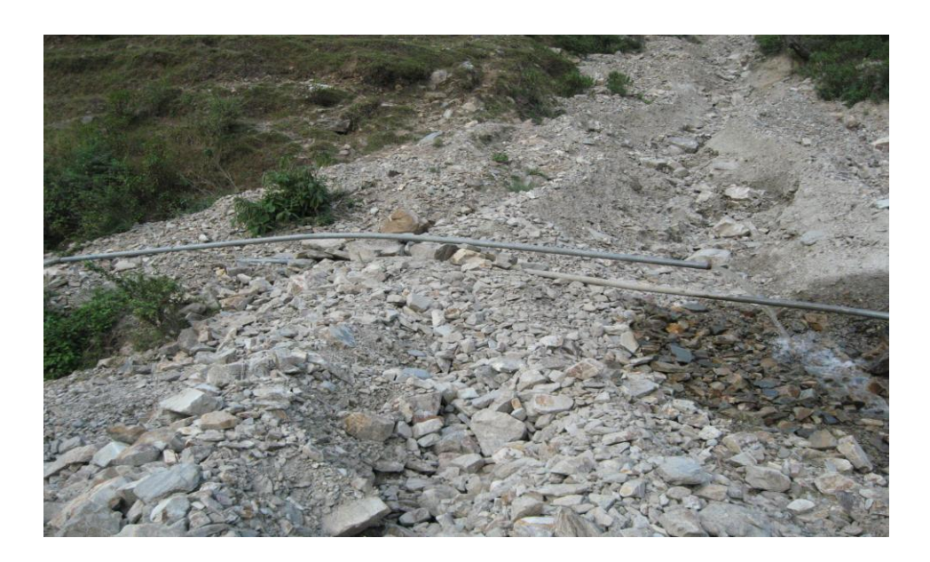
Broken intake pipeline for Bunga Jawari WSS, covering four habitations and two primary schools