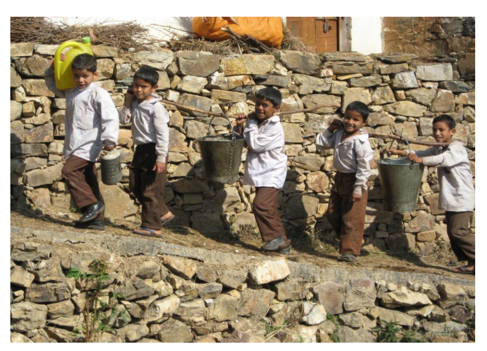
View of School Children taking water