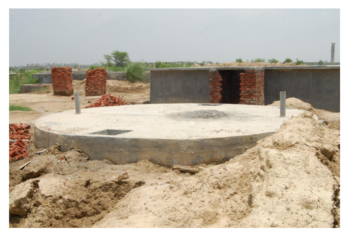
View of WSS, Rindhana lying incomplete