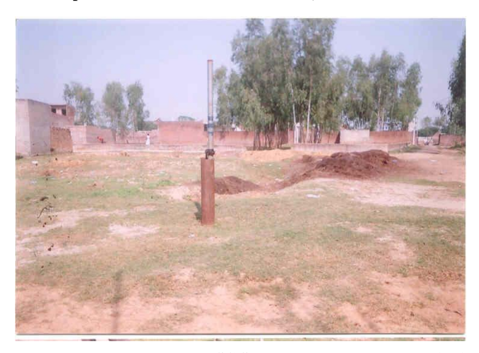
Incomplete Pumphouse at VWSC Sarkara Khas, Moradabad District