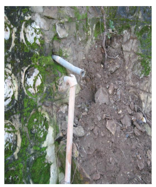
View of Cracked Pushta and Broken Intake Pipeline at Dhaur Barsudi WSS