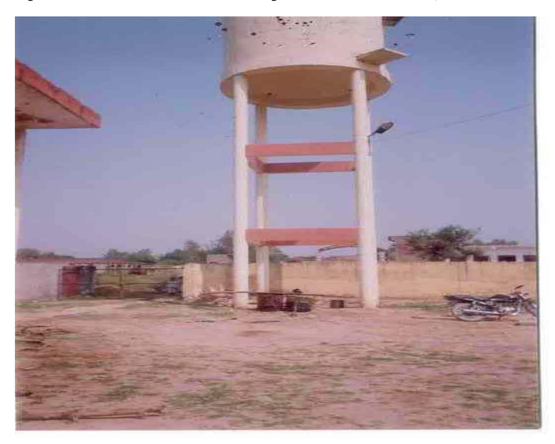
View of Single OHT of 50 KL at VWSC Dalpatpur, Moradabad District