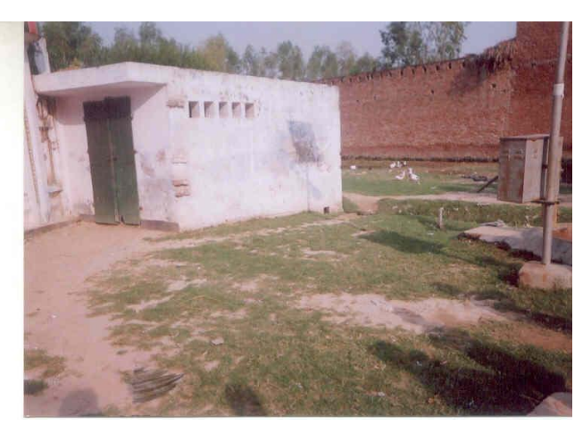
Incomplete construction of OHT and Pumphouse at VWSC Godhi, Moradabad District