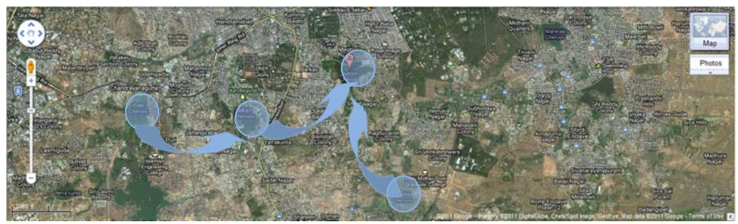
Figure 4: Inlet Channels of Gurram Cheruvu.

The interlinking of lakes is evident in Gurram cheruvu environs. In principle, Gurram Cheruvu is fed by Pedda chruvu and Saikam cheruvu. The inlet channels from the Pedda chruvu and Saikam cheruvu are dysfunctional. The status of the two Cheruvu is no indifferent to Gurram Cheruvu (figure 4).