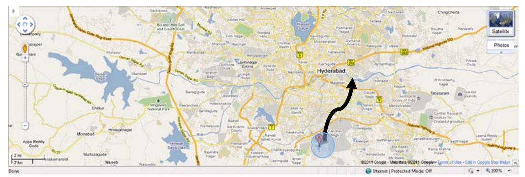
Figure 3: Outlet Tracing of Gurram Cheruvu.

The interlinking of lakes is evident in Gurram cheruvu environs. In principle, Gurram Cheruvu is fed by Pedda chruvu and Saikam cheruvu. The inlet channels from the Pedda chruvu and Saikam cheruvu are dysfunctional. The status of the two Cheruvu is no indifferent to Gurram Cheruvu (figure 4).