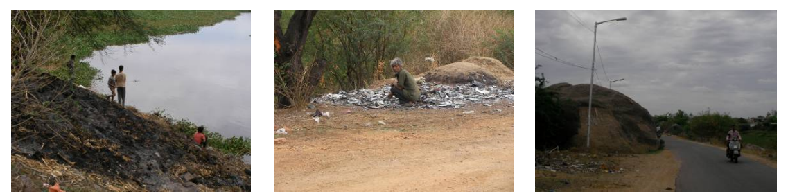
Figure 6: The land water interface embraces many kinds of activities.

From the road level, the lake bed is somewhere around 5-6 metres. This gives an indirect indication of the Full Tank Level (FTL) of the cheruvu. The FTL is generally considered as official reference to earmark revenue area of a lake. The FTL area is the legal entity to protect and conserve the lake's property and functions. The FTL is decided under the purview of the Irrigation Department. The land water interface area is the most crucial part of any lake, which includes the inlet, the outlet and the vast edge of the lake. Interestingly, the interface is also seen as the starting point of the lake rejuvenation (figure 6).