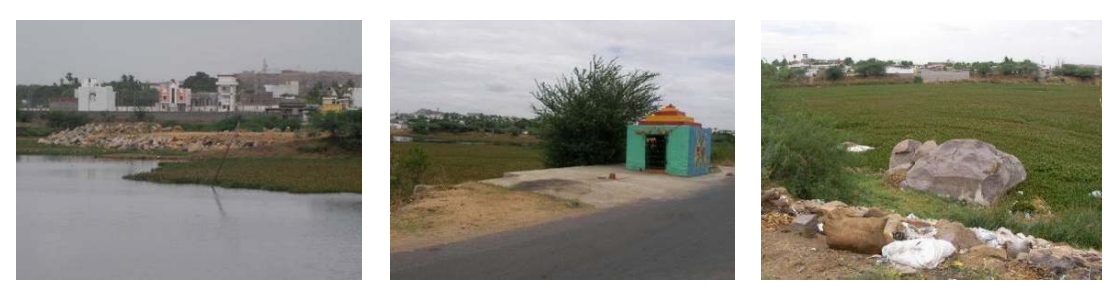
Figure 1: Multiple land use developments around Gurram cheruvu: private, religious, solid waste dump.

Gurram Cheruvu is located at the Barkas area. Barkas, in historical times, is the Military Barracks for Yemenese during the Nizam's time. It is a typical historical place in Hyderabad and is known as 'Mini Arab of Hyderabad'. Today, Barkas area is a typical multi-cultural and multi-functional urban development area.