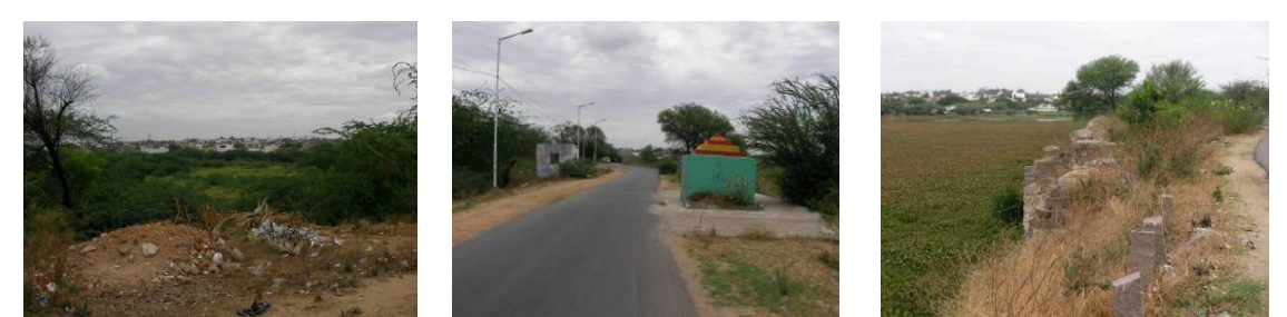
Figure 5: The divided lake: the dike of Maqbool nagar, the road, the old outlet sluice

From the road level, the lake bed is somewhere around 5-6 metres. This gives an indirect indication of the Full Tank Level (FTL) of the cheruvu. The FTL is generally considered as official reference to earmark revenue area of a lake. The FTL area is the legal entity to protect and conserve the lake's property and functions. The FTL is decided under the purview of the Irrigation Department. The land water interface area is the most crucial part of any lake, which includes the inlet, the outlet and the vast edge of the lake. Interestingly, the interface is also seen as the starting point of the lake rejuvenation (figure 6).