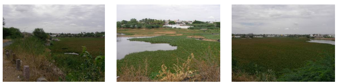
Figure 7: Large surface of Gurram cheruvu is covered with Water hyacinth.