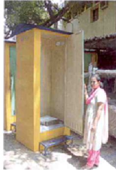
Women Urinal Cabin