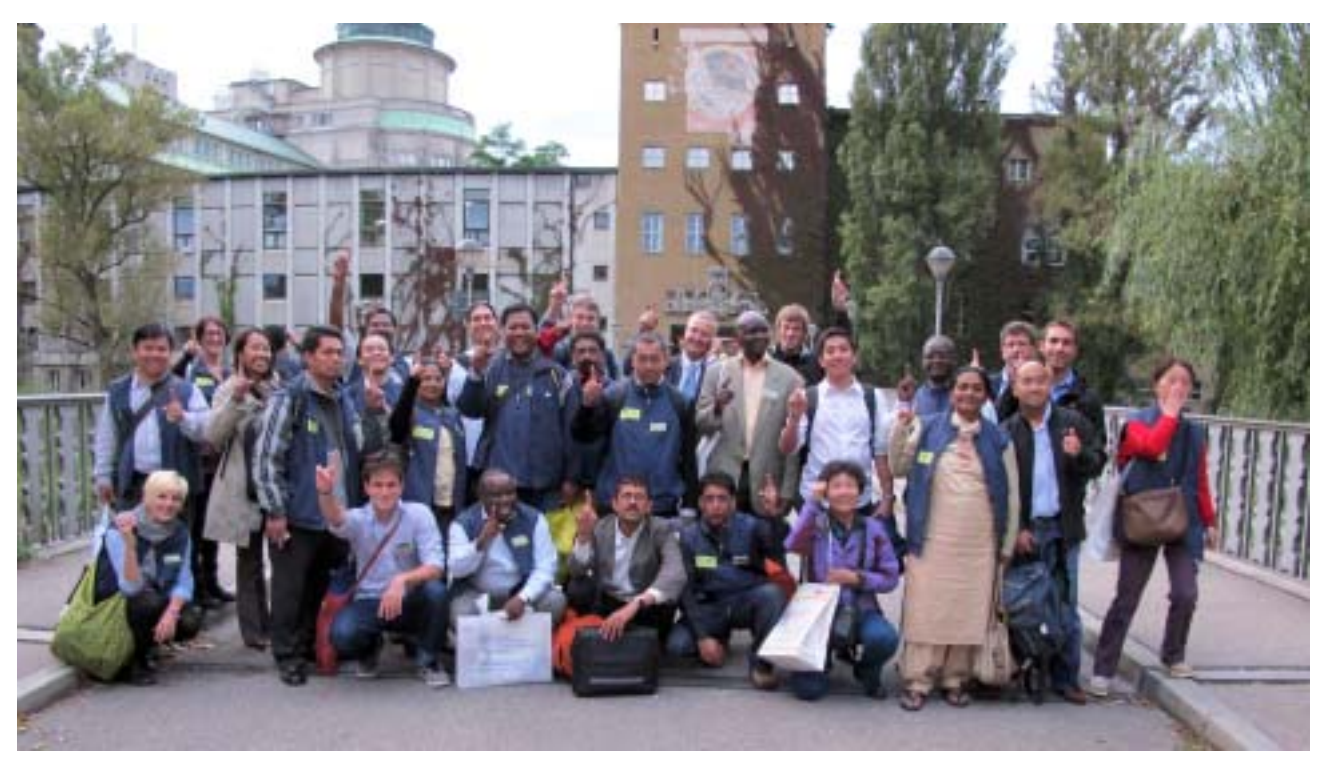
Participants at the APNM 2010, Munich

BORDA participated and showcased its activities in a stall at the trade fair. BORDA South Asia Partners introduced its Centre for Advanced Sanitation Solutions (CASS) as a platform for innovative capacity building towards up-scaling decentralised sanitation services in South Asia. The event provided an excellent opportunity to BORDA partner networks to showcase their presence in the field of sustainable urban sanitation.