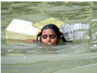
Bangladesh: Case Study

Rainwater harvesting can mitigate this in two principle ways; through the collection of rain before it reaches the ground (as well as from runoff) and by improving the soil's infiltration capacity. Methods of capturing rainfall, from building roofs or sloping land, and storing it in tanks reduces the overall volume of water that would contribute to flooding and has a further benefit of having water available in the ensuing dry period. In-situ methods such as conservation tillage, work at storing water in the soil, improving its moisture content and stopping it from forming a hard surface layer that inhibits infiltration.