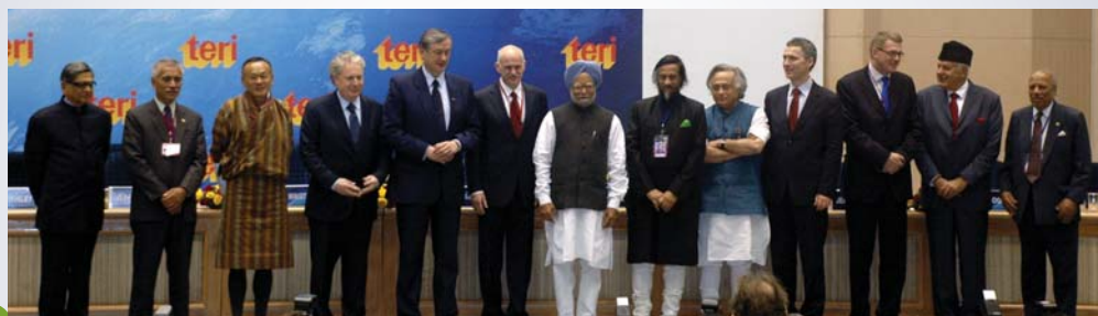
DSDS 2010 Inauguration: (From Left to Right ) Minister for External Affairs, Government of India; President of the Republic of Kiribati; Prime Minister of Bhutan; Premier of Quebec; President of the Republic of Slovenia; Prime Minister of the Hellenic Republic, Greece; Prime Minister of India; Director General, TERI; Minister for Environment and Forest, Government of India; Prime Minister of Norway; Prime Minister of Finland; Minister for New and Renewable Energy, Government of India; and Chairman, TERI

Celebrating its 10 th anniversary DSDS 2010, themed as 'Beyond Copenhagen: New pathways to sustainable development', mulled upon the issues of sustainability in the post-Copenhagen world. It not only brought nations together to discuss the issues of climate change but also charted out a roadmap for the next round of negotiations to be held in Mexico this December. The summit's participation included leaders and opinion-makers from over 60 countries as well as celebrities from the world of art and culture.