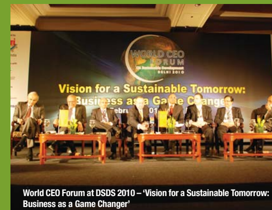
World CEO Forum at DSDS 2010 – 'Vision for a Sustainable Tomorrow: Business as a Game Changer'

Understanding the business sector's impact on the world economy and its role in sustainable development, The Energy and Resources Institute-Business Council for Sustainable Development (TERI-BCSD) India, in partnership with the World Business Council for Sustainable Development (WBCSD) Geneva, introduced the World CEO Forum at DSDS 2004. Since then, over 500 Indian and international companies, heads of state and government officials have attended the forum.