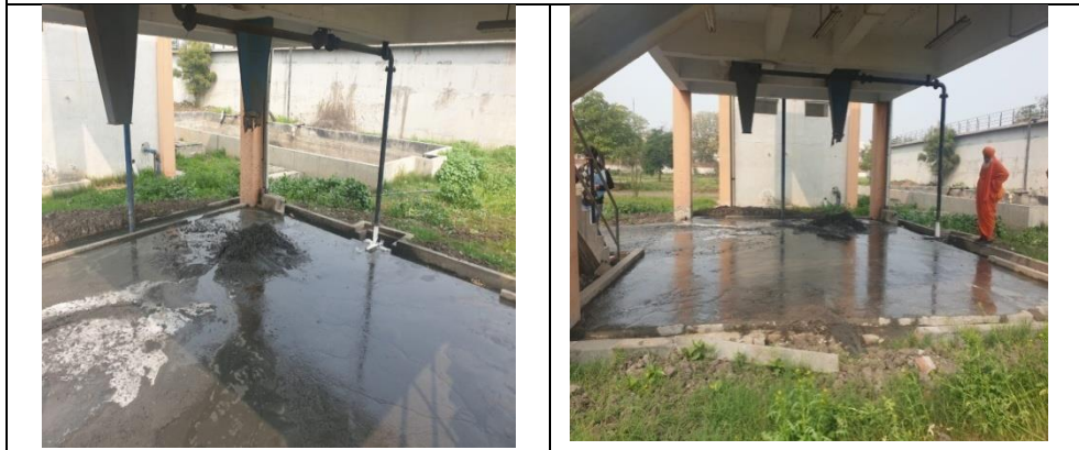
Photographs showing malfunctioning of centrifugal system extracting sludge in liquid form without de-watering

(c) The sludge in liquid form was found thrown in an open area adjoining to the STP, which indicated that the centrifugal system is lying defunct. The photographs showing the liquid sludge lying in the STP premises are mentioned as under: