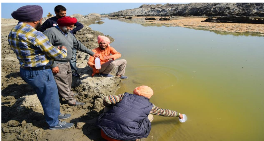
Plate 9: Photograph showing the team collecting water sample of seepage of river Sutlej occurred due to extraction of sand / silt of river Sutlej for construction of Dhusi band.