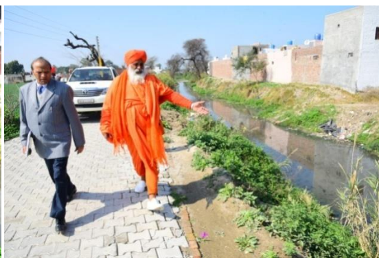
Plate - 2

Plates 1 & 2 : Photographs showing untreated sewage of Sultanpur town by passing to STP alongwith partly treated sewage of STP being discharged into Sultanpur drain leading to Holy Bein