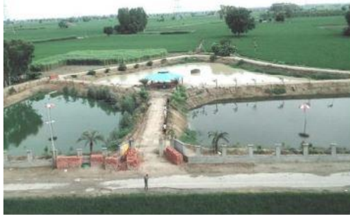
Photograph showing the four-pond system provided to treat sewage of village Chand Nawan

After detailed discussion, the Chairperson directed that the Principal Secretary, Govt. of Punjab, Department of Rural Development & Panchayat shall take up the matter with Finance Dept. of State of Punjab for early release of funds for installation of treatment system for the treatment of village discharges as presently, the sewage / sullage of various villages alongwith villages of Moga district is being discharged into drains leading to River Sutlej.