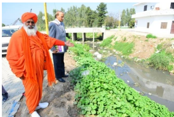
Plate – 1

During visit, it was observed that a lot of untreated sewage alongwith treated sewage of STPs based on WSP technology was being discharged into Sultanpur drain, which is further leading to Holy Bein. Photographs showing the discharge of untreated sewage and partly treated sewage into Sultanpur drain are mentioned as per plates 1 to 3