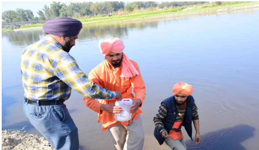
Plate 8: Photograph showing the team collecting water sample of river Sutlej upstream of Gidderpindi railway bridge