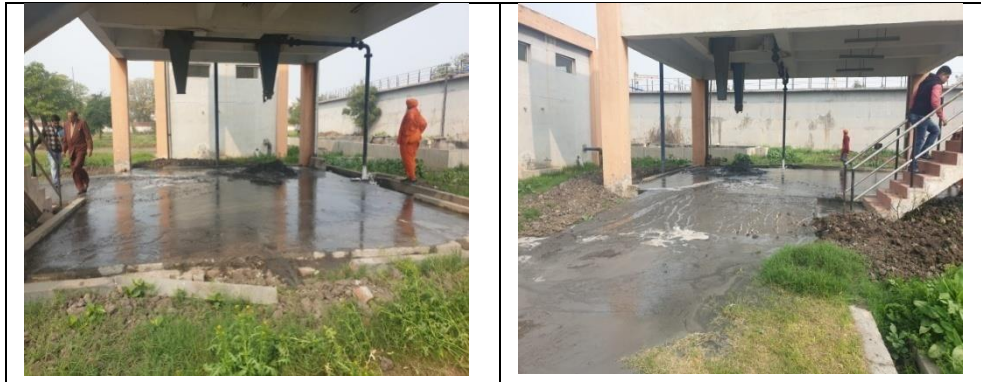
Photographs showing malfunctioning of centrifugal system extracting sludge in liquid form without de-watering