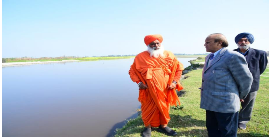
Plate 7: Photograph showing slightly black colored water of river Sutlej at upstream of Gidderpindi railway bridge

The monitoring committee also visited the stretch of river Sutlej at upstream of Gidderpindi railway bridge and it was observed that the water quality of river Sutlej was slightly black in color, which indicates that water of river Sutlej at this point seems to contain high values of BOD, COD, TSS and inorganic parameters. In order to ascertain the water quality of river Sutlej at this location, water samples of river Sutlej and seepage were collected by AEE, Regional Office, PPCB, Jalandhar and the same have been sent to PPCB lab for analysis. The photographs showing slightly black coloured water flowing into river Sutlej and seepage are mentioned at Plates 7 to 9