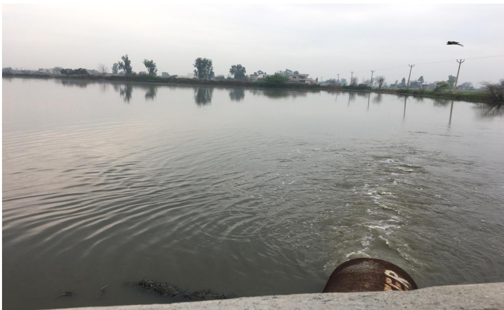
Plates-3: Photograph showing final outlet of STP and effluent accumulated in the pond

While visiting the final outlet of the STP, it was observed that a big pond exists near final outlet which was found containing huge quantity of effluent. The Monitoring Committee was informed that in order to utilize the treated sewage, irrigation network has been laid and the treated sewage is utilized only during demand period but the effluent is accumulated in the existing pond during no demand period. Photograph showing the effluent accumulated in the pond is as per plate 3.