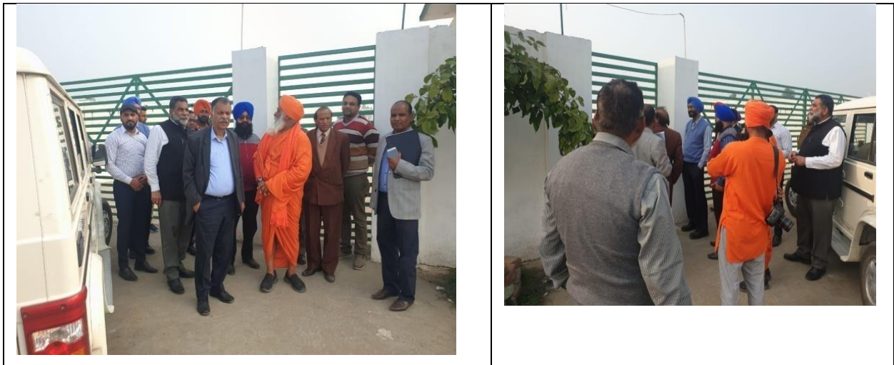
Photographs showing the members of the Monitoring Committee waiting for opening of the gate

The Monitoring Committee reached at the gate of M/s Kathpal Dairies (Unit-II), Village Kokri Phoola Singh, District Moga and it was observed that the security person were available at the gate but they did not open the gate and the same was locked from inside. The officers of PPCB tried to contact the owner of the industry telephonically but the owner did not pick up the phone. The Committee stayed in front of the gate of the industry for about 15 minutes but the gate was not opened by the security guard. These facts indicate that the industry has deliberately locked its gate to avoid the visit of the Committee. The photographs showing the members of the Monitoring Committee waiting for opening of the gate are shown as under: