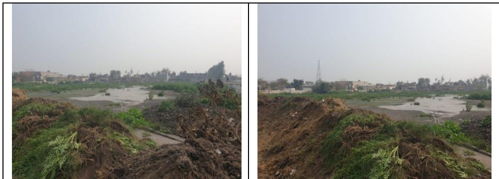
Photographs showing sludge in liquid form thrown at various locations within the premises of the STP

(c) The sludge in liquid form was found thrown in an open area adjoining to the STP, which indicated that the centrifugal system is lying defunct. The photographs showing the liquid sludge lying in the STP premises are mentioned as under: