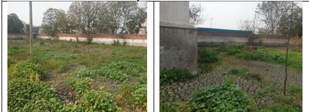
Photographs showing sludge in liquid form thrown at various locations within the premises of the STP