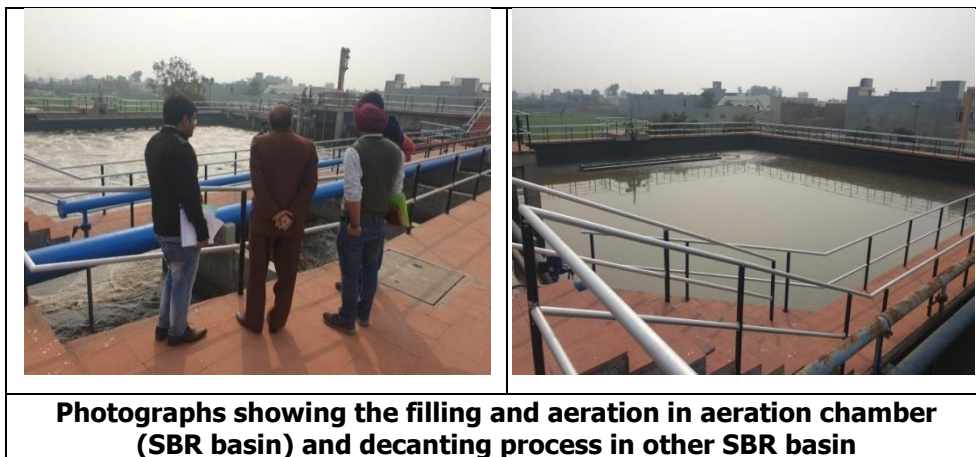
Photographs showing the filling and aeration in aeration chamber (SBR basin) and decanting process in other SBR basin