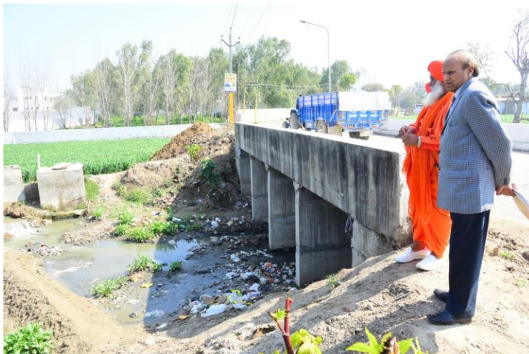
Plate – 5