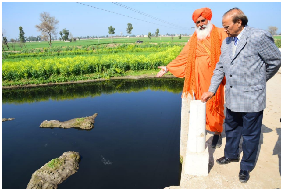
Plate 6 : Photograph showing black colored effluent flowing into East Bein falling into river Sutlej

The monitoring committee noted the water quality of East Bein falling into river Sutlej at Gidderpindi (District Jalandhar) and it was observed that the quality of water of East Bein was quite black containing organic and inorganic matter. The photograph showing water quality of East Bein is mentioned as per Plate 6