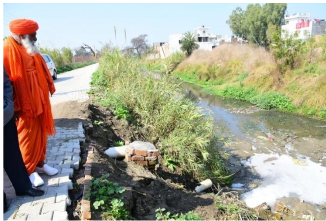
Plate 4: Photograph showing the flow of partly treated sewage and untreated sewage into Sultanpur drain leading to Holy Bein (Kali Bein)

While walking towards STP Sultanpur Lodhi based on WSP technology, the committee observed that the concrete/missionary chamber provided to divert the sewage through pipeline to STP was broken from the bottom and lot of untreated sewage was being discharged into Sultanpur drain and flowing backward due to depression at its upstream and Katcha barrier at its downstream and causing stagnation in the drain at upstream on the other side of the bridge. The photograph showing the discharge of partly treated sewage flowing into drain and discharge of untreated sewage from the breaking point of Masonry/concrete chamber into Sultanpur drain are mentioned as per plates 4 and 5, respectively.